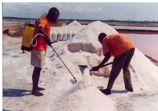
Figure 2 Iodation of salt using a knapsack sprayer and manual mixing of a 2-ton salt heap.

The iodine levels achieved using the diesel/petrol-powered cement mixer recommended as an iodate mixing machine [24] were compared with those achieved by the manual mixing method using the mat/polyethylene sheet. For all heaps studied, the workers used a cropper (a piece